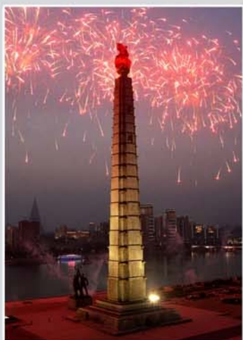
Back Cover: Firework display on July 6, 2017