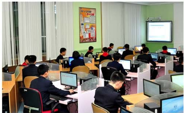
Mangyongdae Schoolchildren's Palace, an extracurricular education centre.