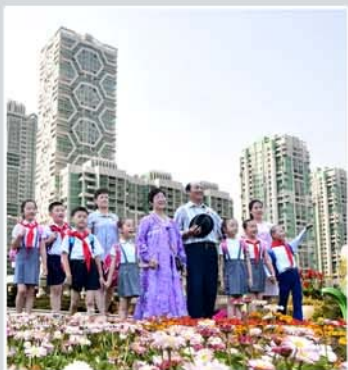
Front Cover: Masters of Ryomyong Street